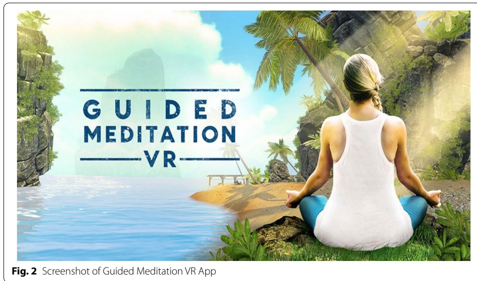
Fig. 2 Screenshot of Guided Meditation VR App

The pretest and the posttest had the time limit set to 30 min, during that time the students were asked to perform basic computer science tasks involving the application of operational systems. The tasks were procedural, requiring students to follow a series of steps, for example: (1) creating a folder, (2) copying items to a folder, (3) creating a title page, (4) tracking changes, (5) renaming files, (6) compressing files, and (7) changing extensions.