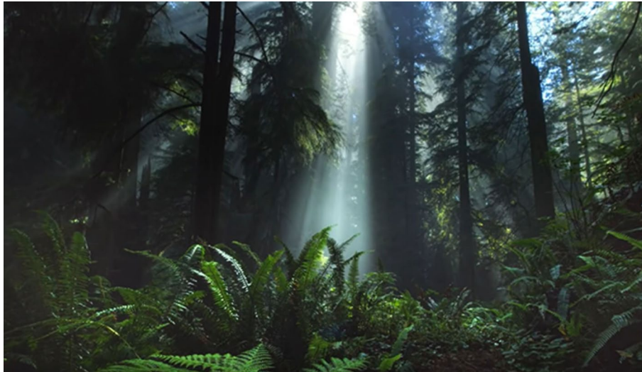
Fig. 1 Screenshot of the Meditation Visualization

meditation practice was considered ineffective. Meanwhile, some research confirms the benefits of short-term meditation because of its convenience and time efficiency (Kosunen et al., 2016; Tang et al., 2007). Our rationale for implementing short-term meditation was threefold. First, according to Tang et al. (2007), short-term meditation could be not only effective but also efficient. Especially in a synchronous classroom setting, taking time for a lengthy meditation is undesirable. Second, using VR for long periods of time is not recommended (Bailenson, 2018). Third, putting students in extended meditative states may induce sleepiness.